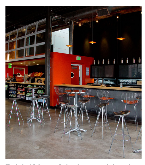
The hub of Galvanize, Gather, features a café, bar and lounge area, where guests and members are encouraged to convene over food and drink to exchange ideas.

Gather — a public café, bar and eatery located in the lobby of the building — functions as the hub of Galvanize's creative engine. Furnished with KnollStudio pieces, it acts as the connection center, pulling in people from both within the Galvanize community, as well as the public. Other spaces include a gym, game room, phone booths and multiple types of high-tech collaborative spaces. Through the strategic use of furniture, each of these interactive group spaces serves a different function and has a distinctive feel — soft seating for casual interactions, high top tables for quick meetings and enclosed conference rooms for formal meetings.