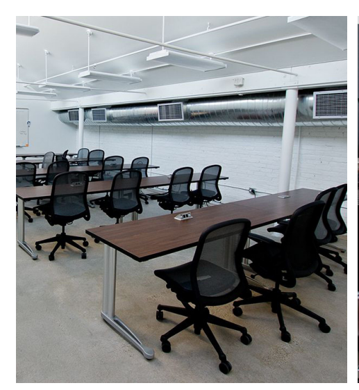
The gSchool's two large classrooms feature easily reconfigurable furniture and ample power and data for the up-and-coming computer programmers; The main floor Atrium, furnished with "hot desks" for beginning entrepreneurs, can easily transform into an event space