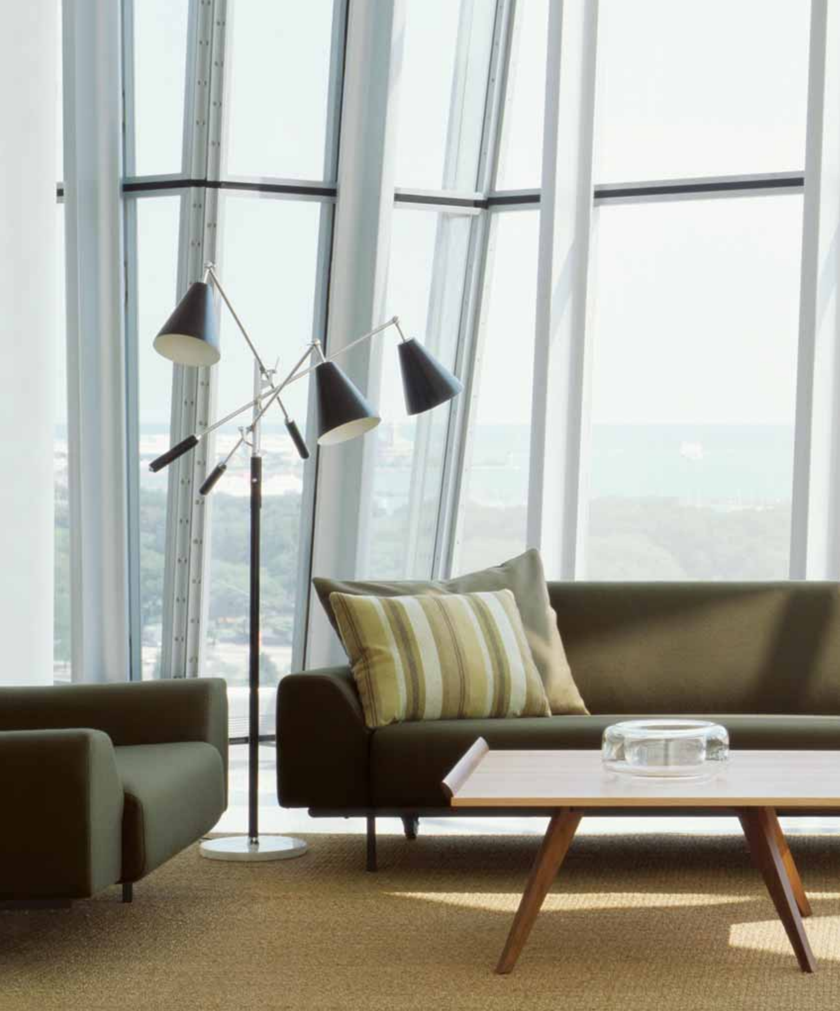
Cini Boeri Sofa and Lounge Chairs upholstered in Knoll Hopsack, Olive; Pillows in Knoll Hopsack, Olive and Celery; Knoll Luxe Galloway, Thistle. Also shown, Nakashima Splay-Leg Table and Florence Knoll End Table.