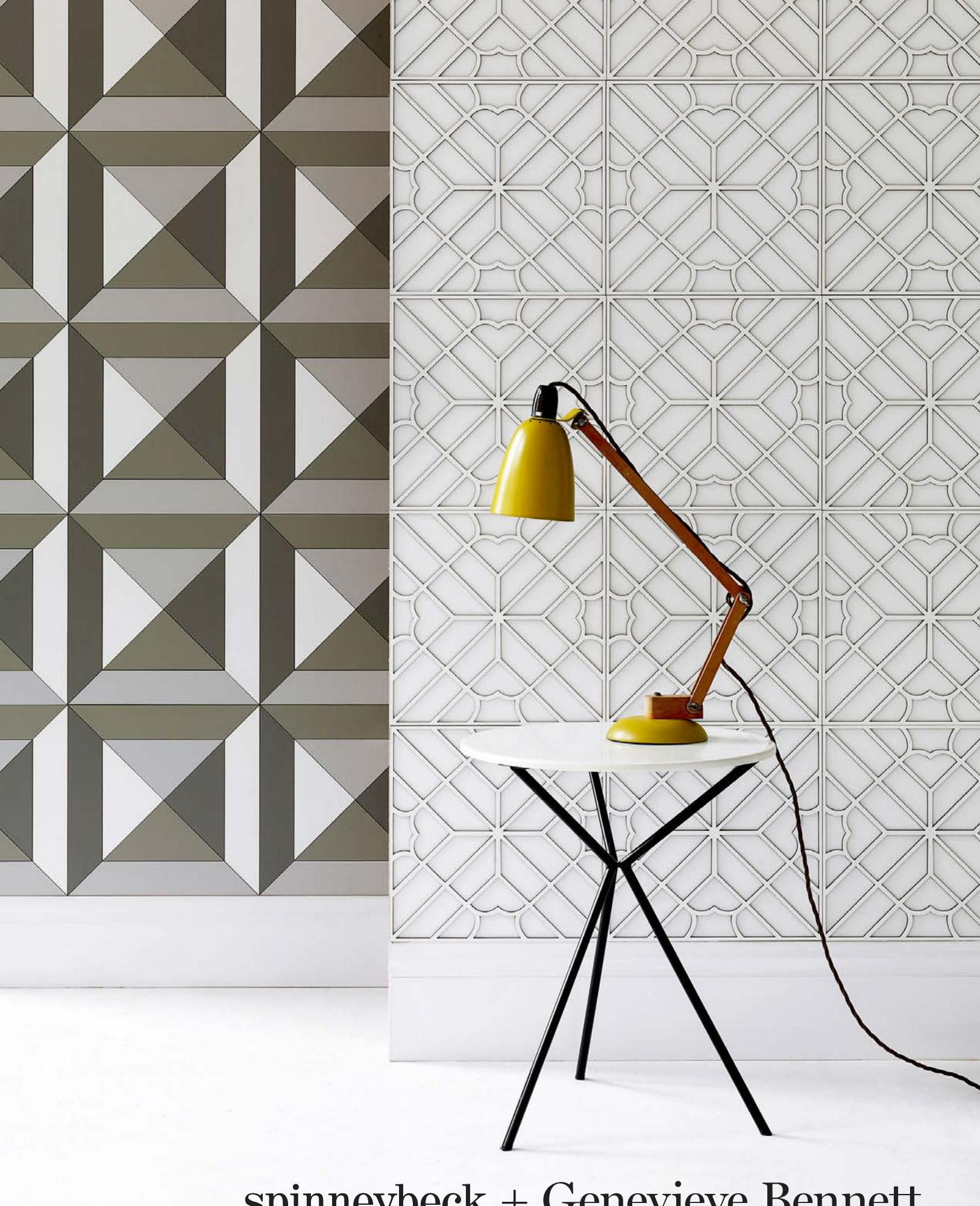
spinneybeck + Genevieve Bennett