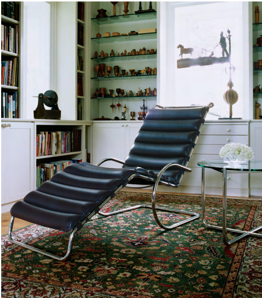
BKS148R © 2006 Kravet, Inc.

LUDWIG MIES VAN DER ROHE "Architecture is a language, when you are very good you can be a poet," wrote the acclaimed architect and Bauhaus director. As a leading Modernist architect and furniture designer, Mies elevated industrial-age materials to an art form. His steel-framed buildings with large-scale glazing, like the Seagram Building in New York (1958) and the Nationalgalerie in Berlin (1968), are landmarks of Modern architecture.