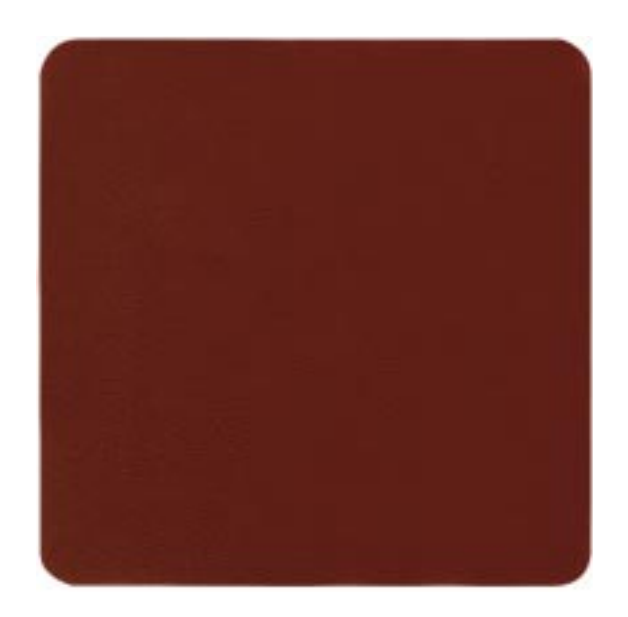
Spinneybeck Full Grain Leather