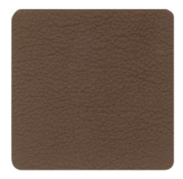
Top Grain Leather