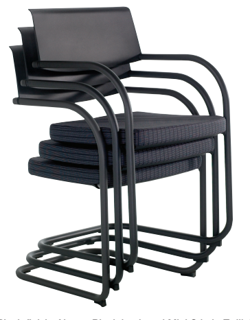
Black finish, Almost Black back and Mini Stitch, Twilight, seat

Taking its cue from the cantilevered form of the classic Tubular Brno chair by Ludwig Mies