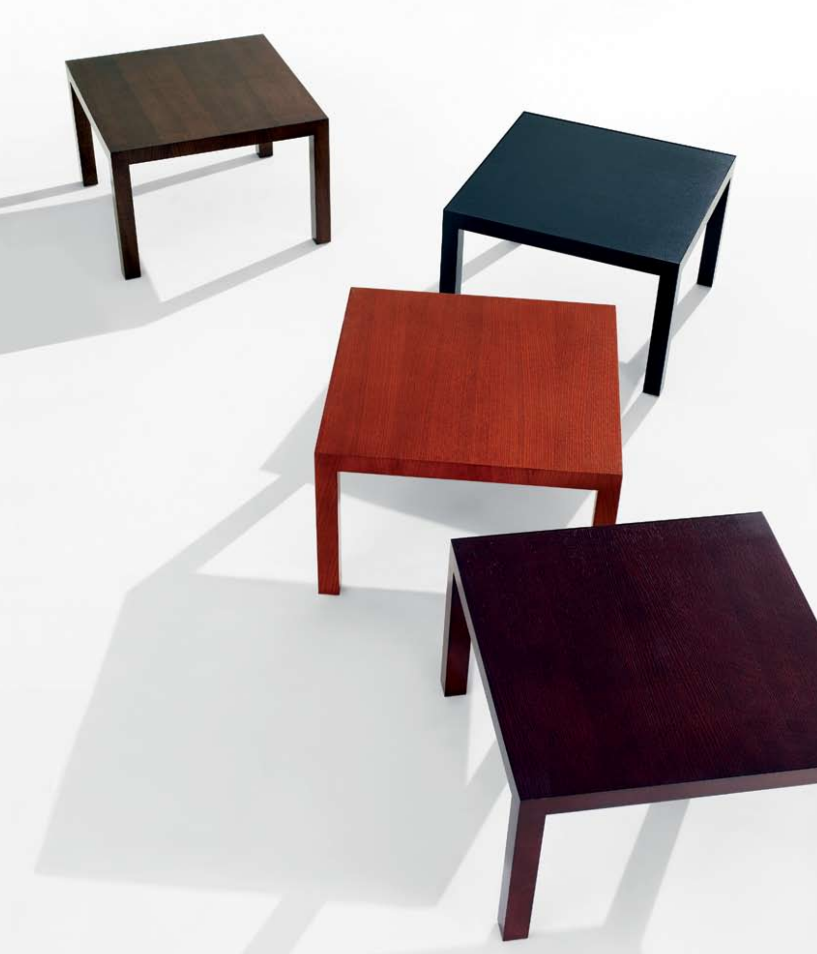
Krefeld Lounge Chair and Ottoman, left, in Spinneybeck Prima leather, Vivaldi with Wengé leg finish. Krefeld Square Tables, above, in Light Walnut, Cherry and Deep Red Mahogany finishes. Rectangular Coffee Table also available.