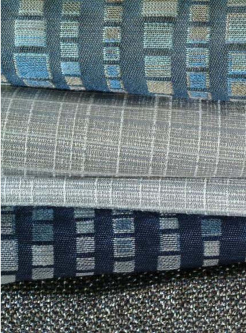
Zari CR, Kora CR and Sequin CR by KnollTextiles