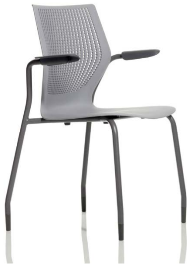
MultiGeneration stacking chair