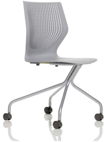
MultiGeneration hybrid chair