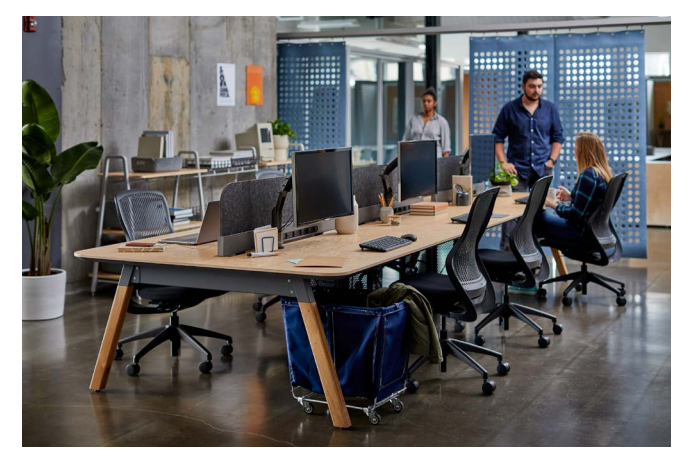
Rockwell Sawhorse Tables and Hospitality Carts are among the many Knoll Office products that bear the FSC® mark that assures wood was sustainably sourced from forests that protect environmental, social and economic values.