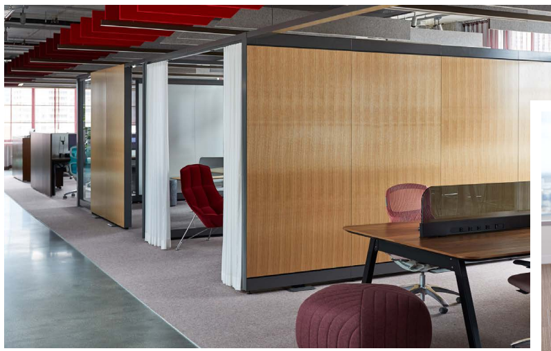
Top: Wood can help delineate space in the office environment when used on on workstation panels and gallery screens and on architectural solutions such as on Knoll's Rockwell Creative Wall. Right: Wood's appeal across multiple generations makes it an ideal choice for desks and workstations.