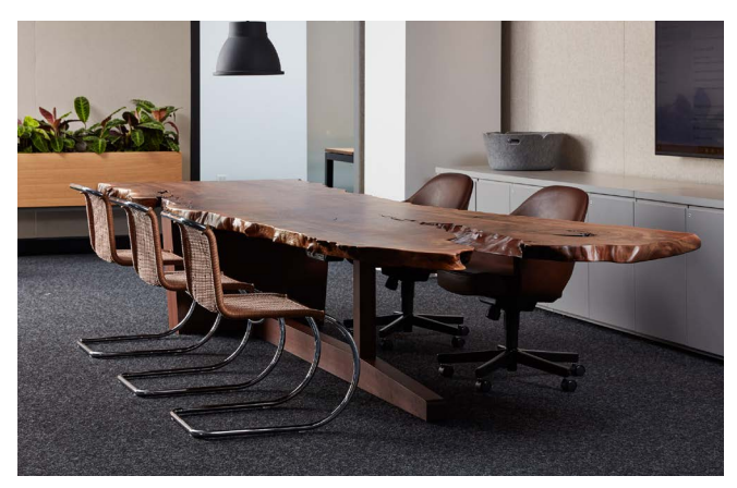
Live-edge trim brings an added touch of nature and authenticity to a custom Datesweiser wood table.

Wood is the only building material that helps tackle climate change. Not only do trees release oxygen, they reduce new carbon emissions by absorbing carbon dioxide from the atmosphere. Wood products then store the carbon that the growing trees have removed from the air and use it to produce sugars and fiber for growth. Estimates are that for every ton of