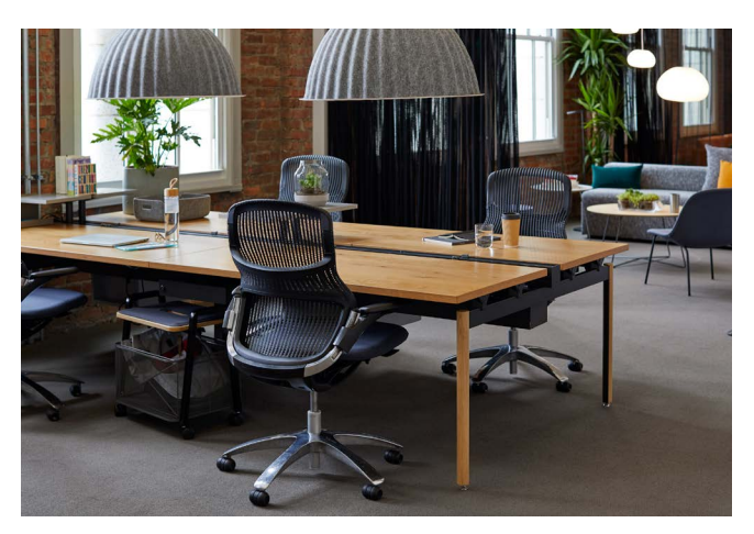
Wood adds warmth to the office environment, along with a touch of nature that can be viewed by all neighborhood users.

According to a study conducted by architectural firm HOK, simple visual changes in texture can keep workers alert. Thus a wood surface, with both visual and tactile sensory stimulation, helps boost attention better than monolithic and monochromatic design schemes.