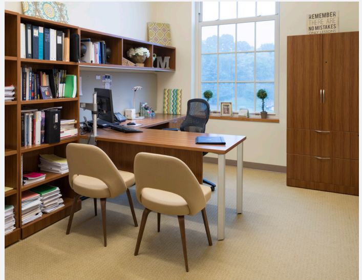
Farrell Hall provides offices and work areas for 170 faculty and staff. Featured: Dividend Horizon, Reff Profiles, Series 2, Generation by Knoll Work Chairs, Saarinen Executive Chairs

the architectural vocabulary of other campus buildings. In contrast, Farrell Hall's dramatic glass curtain wall signals a state-of-the-art interior as it floods the space with light.