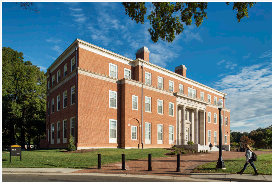
Farrell Hall's traditional brick exterior maintains continuity with the other buildings on the Wake Forest campus.