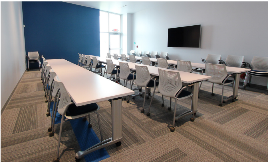
The VNA's training room features Propeller tables that can be folded for easy storage. There is also an entrance door for easy access to members of the public who visit the VNA for trainings or meetings. Featured: Propeller Tables, MultiGeneration by Knoll Stacking Chairs

Through an unexpected chain of events, the VNA was able to donate its space to a charity that makes meals for those in need, and the process to move was set in motion.