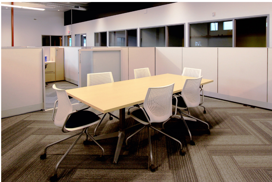
The team's "bull pen" is a favorite meeting place for staff since it is close to their workspaces and easy to book for informal gatherings. Featured: Dividends Horizon Table, MultiGeneration by Knoll Stacking and Hybrid Chairs

money. I didn't think our space mattered that much. I was resistant." Now she sees that her staff works more as a team and truly cares about each other.