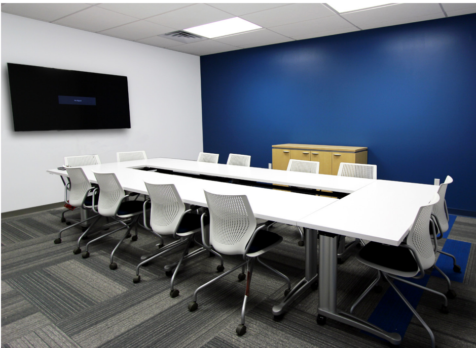
The VNA team’s formal meeting room has flexible furniture pieces that can be rearranged to accommodate different groups sizes and activities. Featured: MultiGeneration by Knoll Hybrid Chairs, Propeller Table

Continuing to push for greater efficiency and more collaboration, the architectural team created several shared spaces in the new office, including a work room, meeting room and break room.