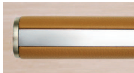
Channel style, flat wrapped handrail in DE203 with stainless steel end cap and brushed aluminum channel insert on bottom of handrail.