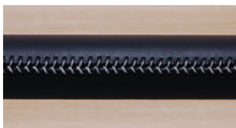
Flat wrapped handrail in AL5015 with baseball stitch.