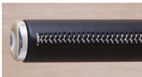
Flat wrapped handrail in AL5015 with stainless steel end cap and baseball stitch.