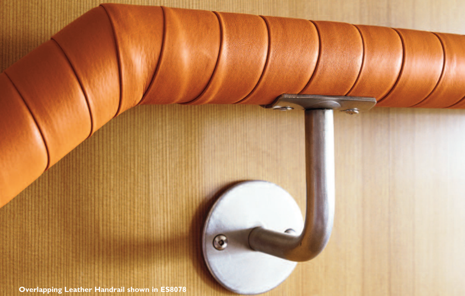
Overlapping Leather Handrail shown in ES8078 with custom stainless steel bracket.

In a contemporary or more rustic environment, Spinneybeck Leather Handrails add a beautiful tactile quality to any installation. Handrails can be further enhanced with embossed patterns, perforated accents, and contrasting stitching. The unlimited range of colors and leather styles offer abundant design solutions.