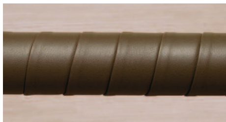
Overlapping wrapped handrail in RA1812.