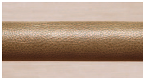
Flat wrapped handrail in HT1511.