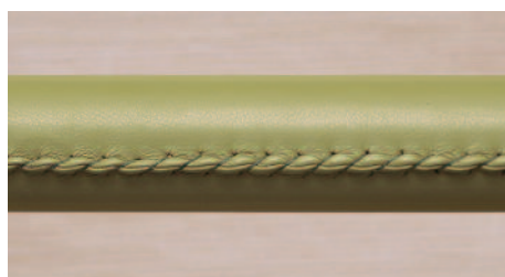
Flat wrapped handrail in SA2088 with pinch stitch.