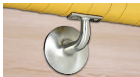
Stainless steel brackets are available through Spinneybeck.