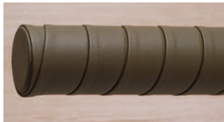
Overlapping wrapped handrail in SL66 with leather end cap detail.