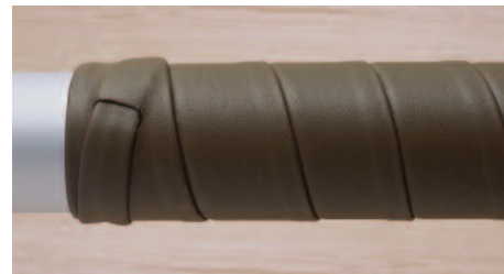
Overlapping wrapped handrail in SL66 with tucked finish detail.