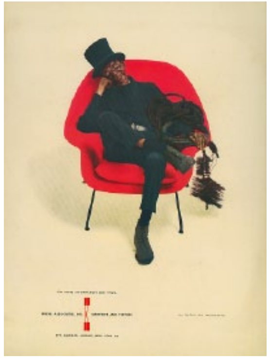
Herbert Matter's "chimney sweep" ad for Eero Saarinen's Womb Chair, ca. 1955. The ad ran on the inside front cover of The New Yorker's anniversary edition from 1958 to 1971

whole period in my life was exciting because I had gone in the wrong direction. I had gone two years to Engineering School and was very unhappy with that. When I got to the Institute of Design, I really liked it. We were very conscious in that school of being an extension of the Bauhaus.