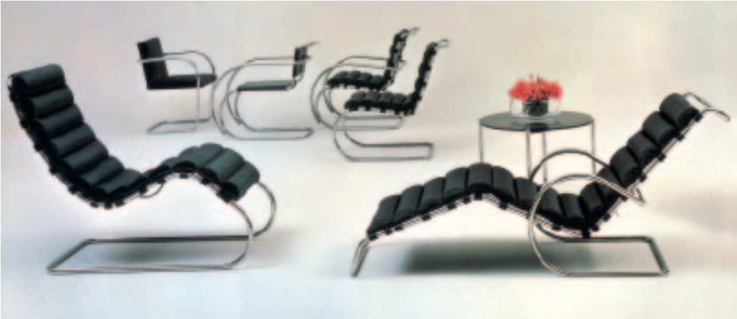
The Mies van der Rohe Collection

We used to go over to the Knoll showroom as students and turn the chairs over and look at them. It was an exciting period — 1949 or 1950 — just after the war when everything was starting to move. Eero's Womb Chair — the whole thing was exciting. That