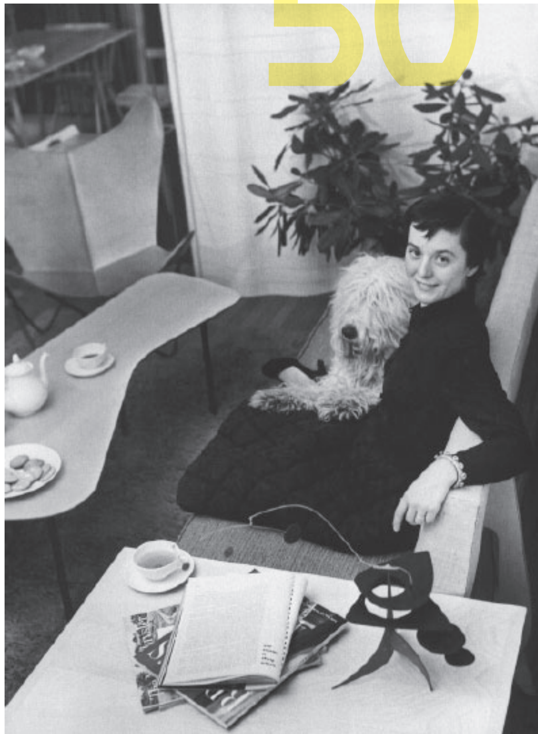
Florence Knoll, ca. 1948

The story of midcentury modernism in America is inconceivable without Knoll, the furnishings and textiles company founded by Hans Knoll in 1938, and joined by Florence Knoll (née Schust) in 1941. With Knoll's generous per-mission, photographs from its archives and unpublished interviews with the designers in the company's orbit set these figures in dialogue — capturing and complicating the making of a modern legend.