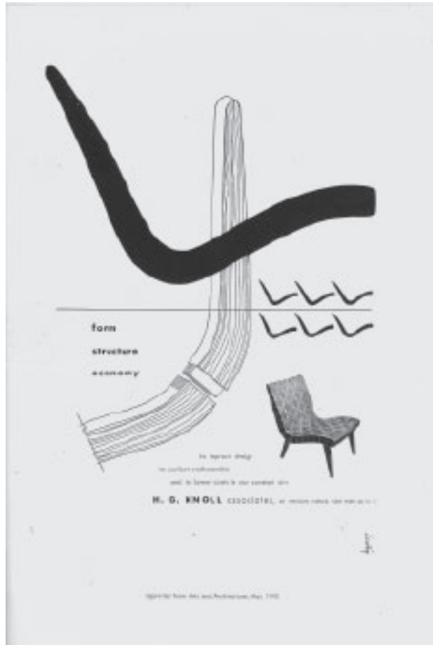
Alvin Lustig ad for Jens Risom lounge chair in Arts & Architecture Magazine , 1945