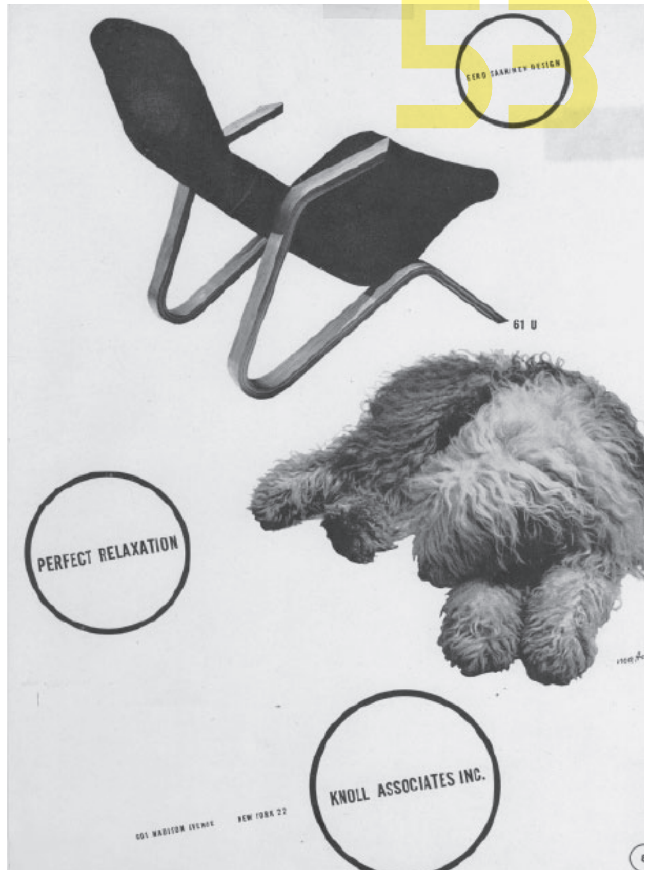
Herbert Matter ad for Eero Saarinen's Grasshopper Chair, featuring the Knoll dog Cartree