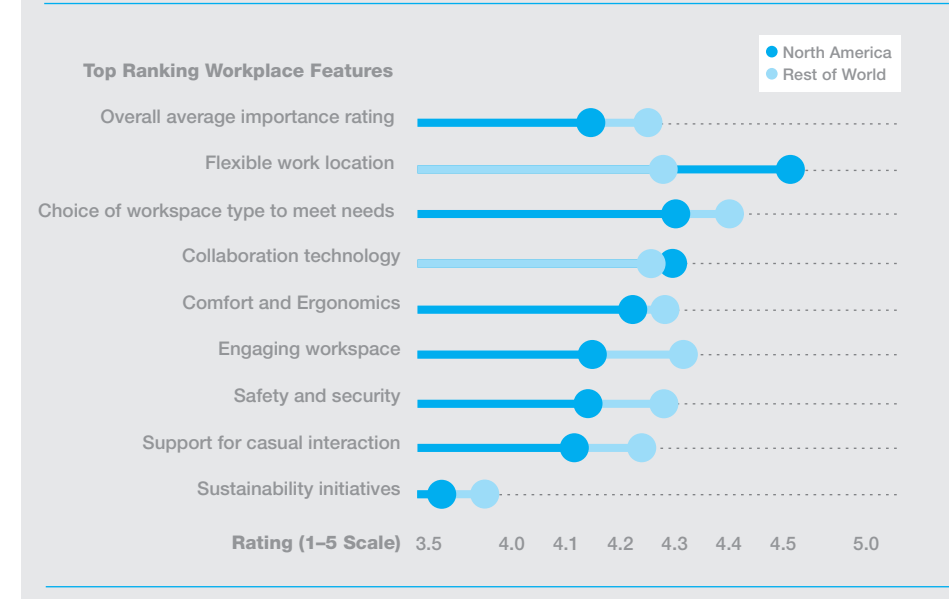
Table 4. Comparison of the average importance ratings for each of the eight workspace features (using a five-point scale for which 1=least important and 5=most important). Top of Table 4 shows a single "overall importance rating" comparison between Rest of World and North America that is an average of the eight feature rating scores. The importance scores are arranged in descending order of the North American ratings, with the most important features at the top.

workstyle flexibility in terms of time and location (O'Neill and Wymer, 2011).