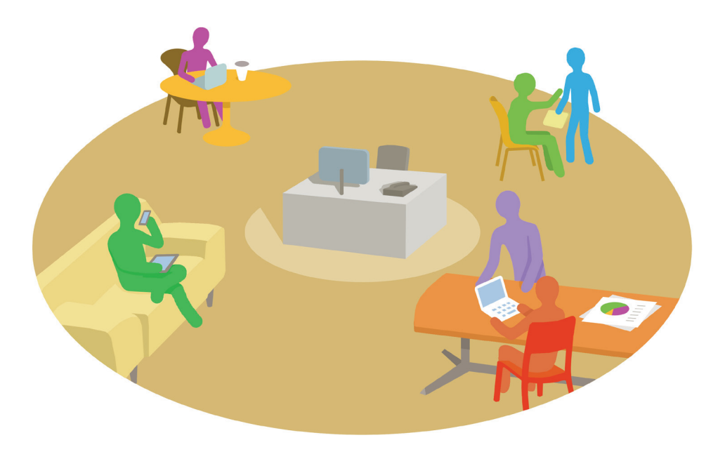
With the ability to work anywhere, employees are working with greater frequency away from their primary desks. Good workplace planning supports a variety of work locations and types of space for employees, as they move through the facility