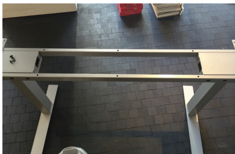
Fixed Width Crossbar