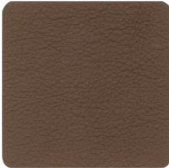
Top Grain Leather